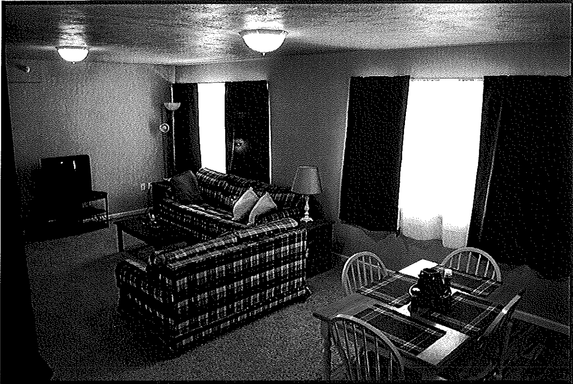
One of the apartments furnished by Sunnybrook Community Church.